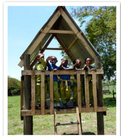
Children playing on the 'fort' built at Nyota.