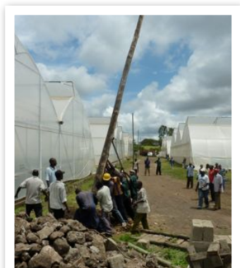
Students helping put up the new electricity poles, after 6 weeks of no electricity.