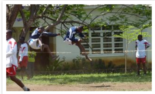
The Sports day: synchronised high jump?