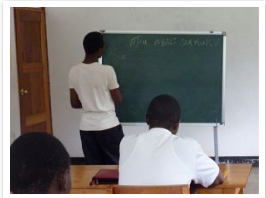
Njia Mbili za Kuisibi: 2 Ways to Live