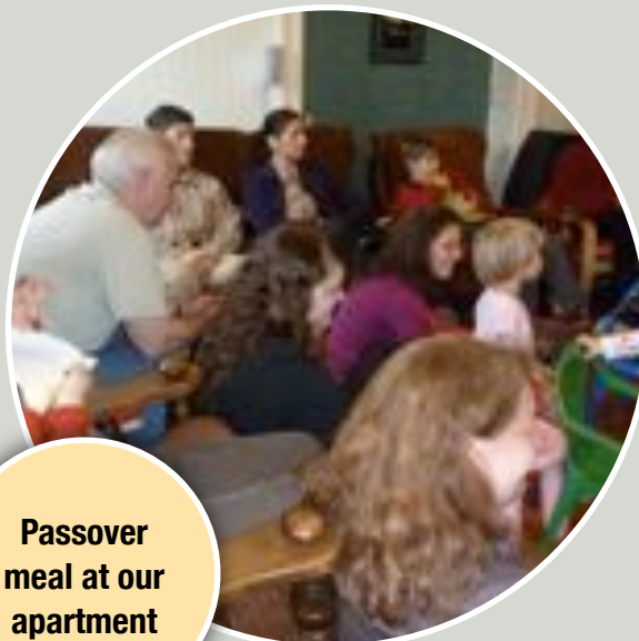
Passover meal at our apartment