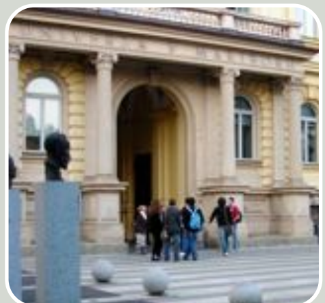
University of Maribor