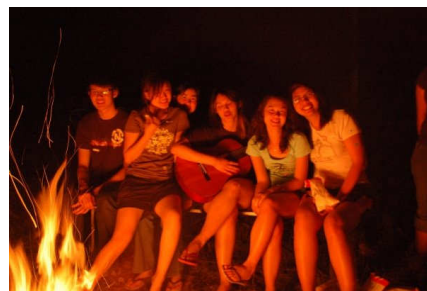
Singing by the campfire