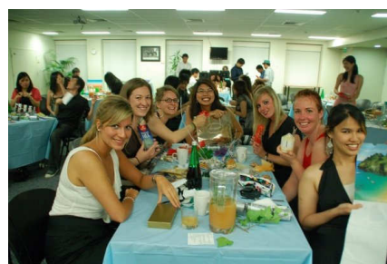
Students from Sweden, Australia, Germany and Malaysia share Christmas Dinner and gifts