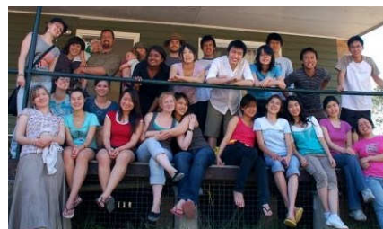
Camp group photo