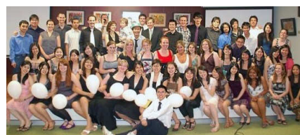
Christmas Dinner and farewell