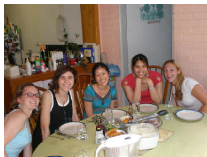
Thanksgiving lunch with Grads