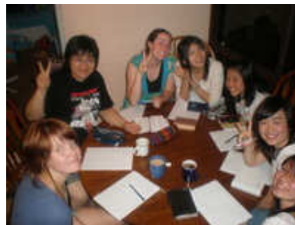
Bible Study night at the girls ESL table